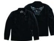
WILDCAT RIDING JACKET WITH GUARDIAN TECHNOLOGY 97203-09VM $175