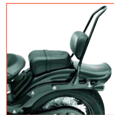
SISSY BAR UPRIGHT

Detachable, all you need to do is purchase and bolt on the special docking hardware. It's quick and easy. Better yet, it's a one-time deal — the hardware stays on your bike and blends right in.