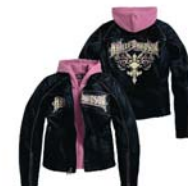
TEMPEST 3-IN-1 LEATHER JACKET 97086-09VW $425