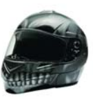
SKULL MODULAR HELMET 97237-09VM $295