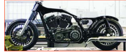
NEW TOURING CHASSIS WITH EXHAUST ROUTED UNDER THE FRAME

Also new for the model year, the introduction of the Tri-Glide! The new three wheeler is fitted with a 103 cubic inch engine, oil cooler, awesome suspension and a reverse is optional! This is one smooth trike! Stop in and talk to one of our sales people for more details.