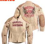
LUNA MESH JACKET 97216-09VW $175