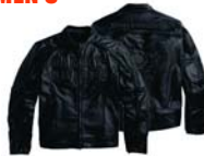
BLADE SKULL JACKET WITH SWITCHBACK TECHNOLOGY 97071-09VM $475