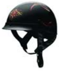
RIPLEY HALF HELMET 97219-09VW $175