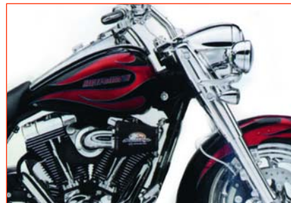
CUSTOM PAINT SETS

The Harley-Davidson luggage has been taken to the next level with a lot of improved features and with the ease of removal, it makes a great way to haul things when you need to and keep the custom look of the bike when you are not. Check out the multi-fit section of the new Parts and Accessories catalog or go online to see what's new in luggage for the bike.