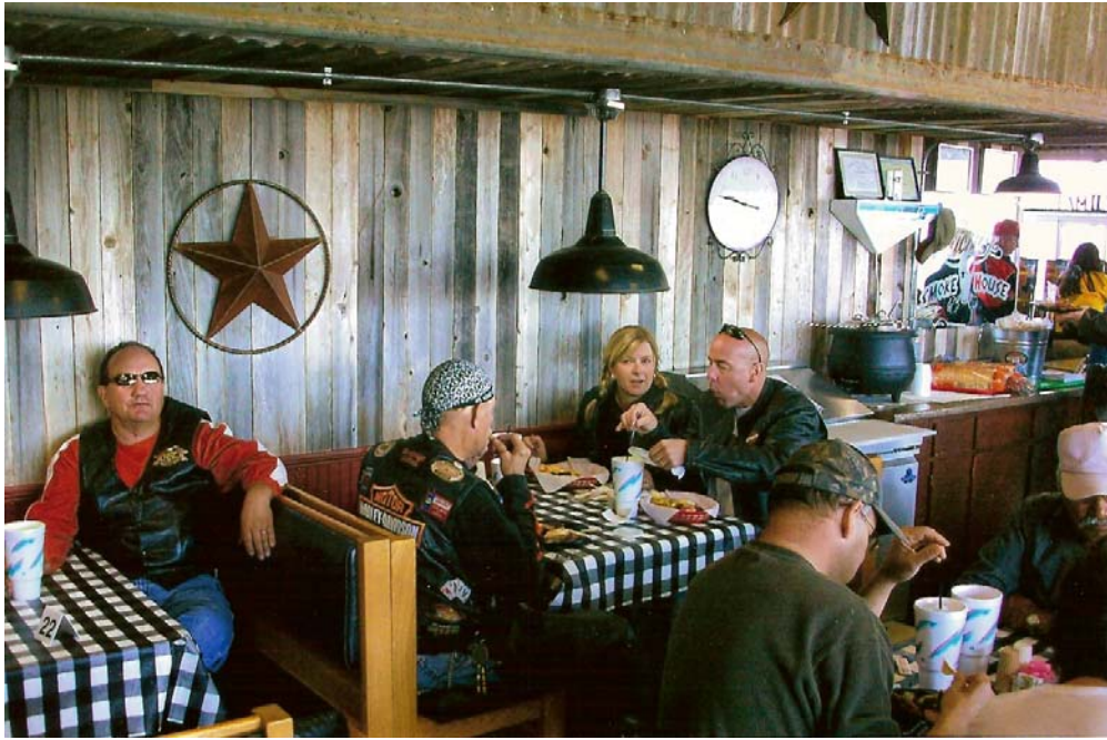
Luchi's Barbecue in Stanton, Texas