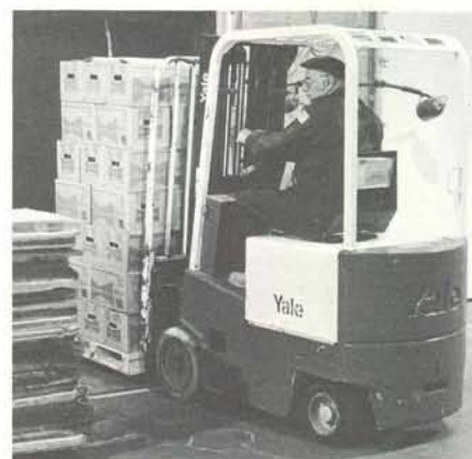
Yale electric rider loads cases of Budweiser beer onto one of Quality's delivery trucks.