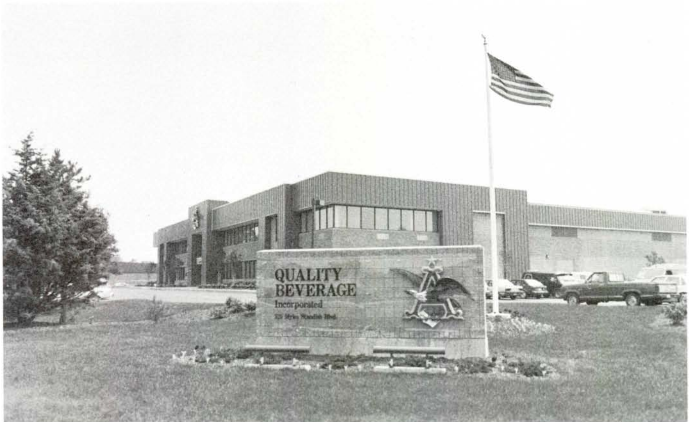
Quality Beverage, Inc. headquarters and warehouse facility located in the Myles Standish Industrial Park in Taunton, Massachusetts.

Successful Anheuser-Busch distributor cites Yale service and reliability.