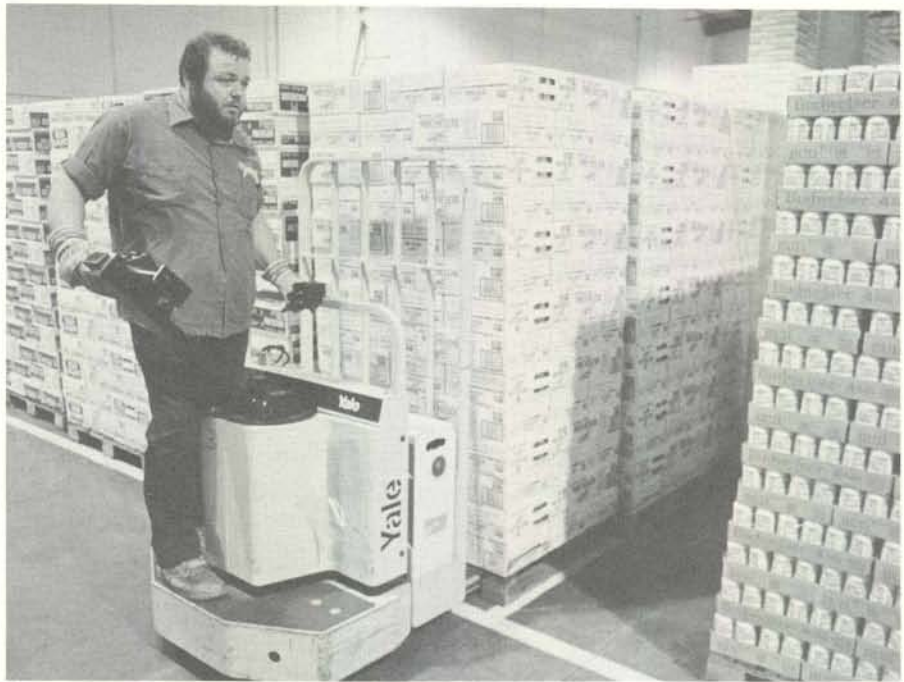
One of the three Yale MPE-040T motorized hand trucks used at Quality Beverage in their staging areas, and for loading their 30-foot delivery trailers.