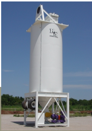
Also available: Vertical Pig Silo