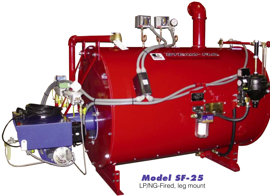
Model SF-25 LP/NG-Fired, leg mount

370 - 845 Lbs. per hour of saturated steam in minutes • Continuous, Unlimited Steam Simple Operation • Easy Maintenance • Built To Last