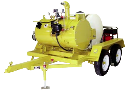
Self-contained Model SF-11, Oil-Fired with water tank, generator and highway trailer