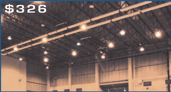
400 watt Metal Halide: Annual Energy Cost*