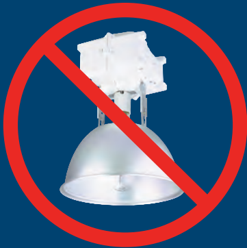
400 watt Metal Halide

Annual savings of $16,200 for every 100 fixtures replaced one-for-one*