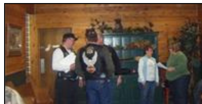
Taken by Buddy