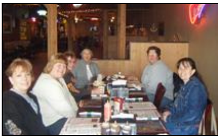
←LOH - Miracle Hot Springs→

Next meeting is at Idaho pizza on March 17th.. Please come, we would love to see you!