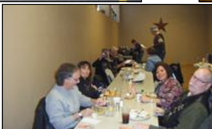
April dinner meeting at That 1 Place in Buhl