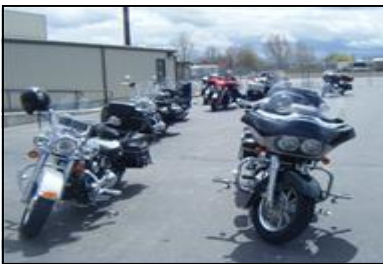
First stop: Regi & Larry's house