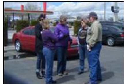
Head 'em up, move 'em out!