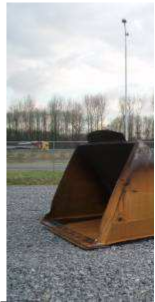
Viewing Photo 1 of 5