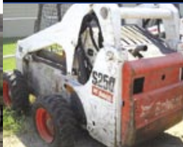
2008 Bobcat S250-P, 3,940 Hrs., Tulsa (AS IS) EN 1014853 $ 14,950