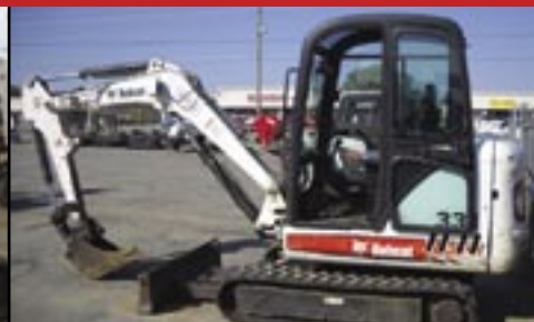
2008 Bobcat 331-R, 1,333 Hrs., Tulsa, EN 1015059 $ 28,850