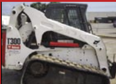
2007 Bobcat T300-U, 2,564 Hrs., Tulsa EN 2137318 $ 31,800