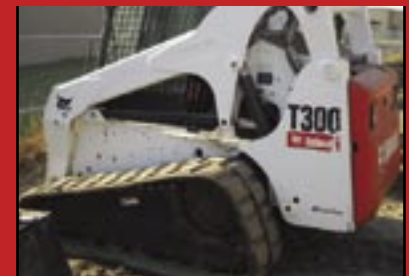
2006 Bobcat T300-P 1,585 Hrs, Tulsa EN 1029372 $ 37,500