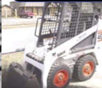
2007 Bobcat 463-P, 2,496 Hrs., Tulsa, EN 1034868 $ 8,950