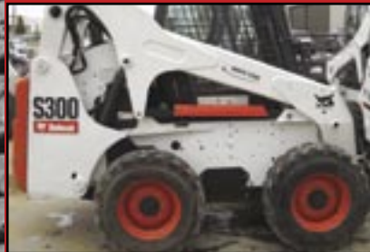
2008 Bobcat S300-P, 1,169 Hrs., Tulsa EN 1030642 $ 33,850