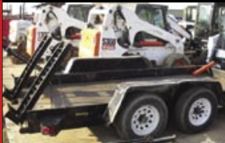
Felling Trailer - FT-10FP-P EN 1047984 $ 1,950