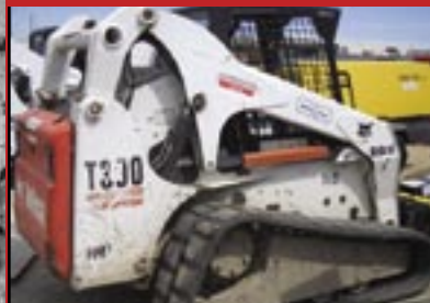
2002 Bobcat T300-P, 3,560 Hrs., Tulsa EN 2131236 $ 24,950