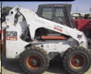
2007 Bobcat S250-P, 1,672 Hrs., Tulsa EN 1043454 $ 34,950