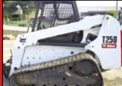
2008 Bobcat T250-R, 1,095 Hrs., Tulsa EN 1043455 $ 38,950