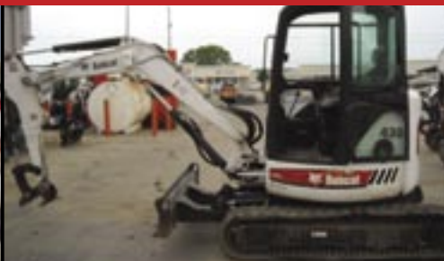
2007 Bobcat 430 Excavator w/Cab/ Heat/Air, 1,376 Hrs., Tulsa EN 2416459 $ 26,850