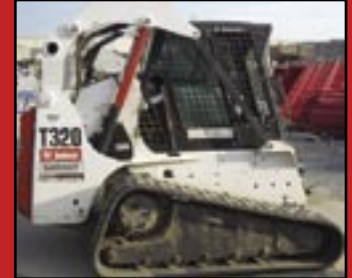
2008 Bobcat T320-P, 1,120 Hrs., Tulsa, EN 1047981 $ 48,800