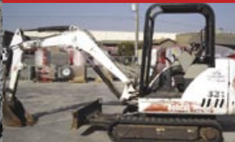
2001 Bobcat 331-U, 3,818 Hrs., Tulsa EN 2410327 $ 15,850