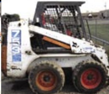
1996 Bobcat 753-U, 4,035 Hrs., Tulsa EN 2406505 $ 7,950