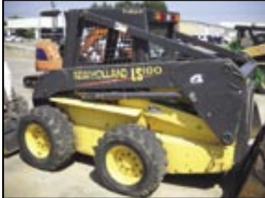
2004 New Holland, LS180-U, 993 Hrs., Tulsa, EN 1045386 $ 15,850

Low Rate Financing Available on Used Rental Fleet - W.A.C. Call for Details TODAY!